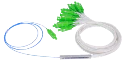
SP FO 16