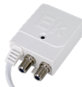
FA 12 MINI