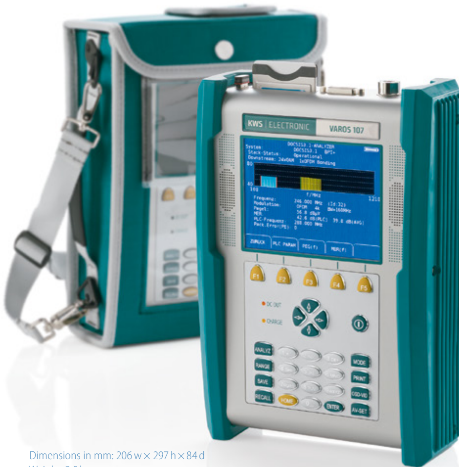
Dimensions in mm: 206 w × 297 h × 84 d Weight: 2.5 kg