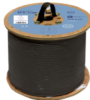
CCR 11 CU coil with Ek ROLLER system