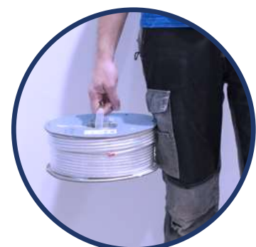
EK ROLLER REEL HANDLE