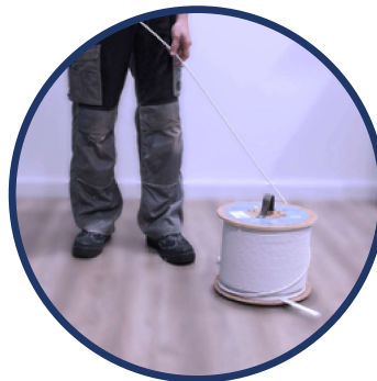
EK ROLLER COIL UNWINDING